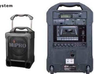
(MA707 Control Surface)

It's perfect for today's professional auctioneer!